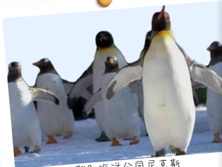
登别海洋公园尼克斯 Noboribetsu Marine Park NIXE