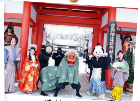
伊达时代村 Date Jidaimura